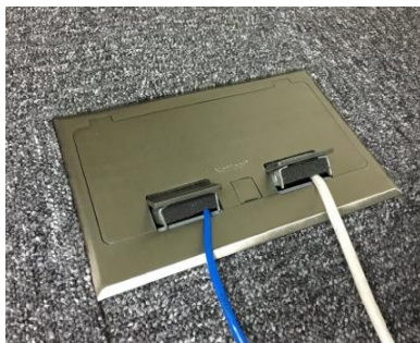
For Plug Type G